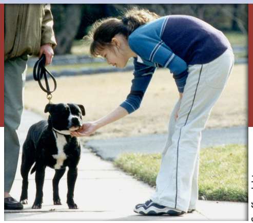
Canine Ambassador "Billy D" visits schools to teach children how to be safe around dogs.

AKC® believes a dog should be judged by its deeds, not its breed. We are dedicated to the passage of reasonable, enforceable, non-discriminatory laws to govern the ownership of dogs.