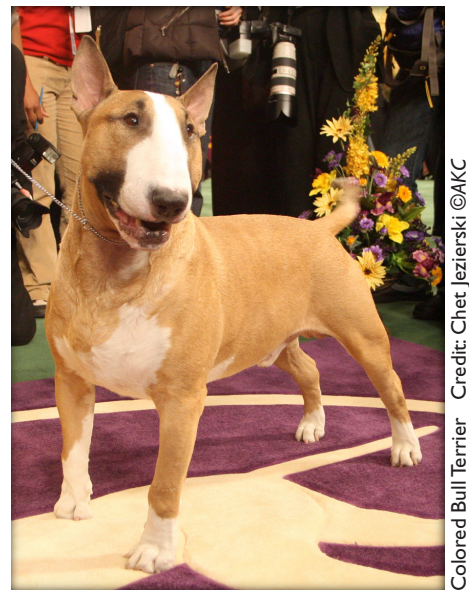
Best-in-Show winner "Rufus" is not only a seasoned show dog but a fun-loving family pet.

Unfortunately, some legislators believe they can protect their communities by imposing laws that restrict or completely ban dogs based on breed alone, with little or no consideration of well-mannered canines. AKC knows there are better, more effective alternatives.